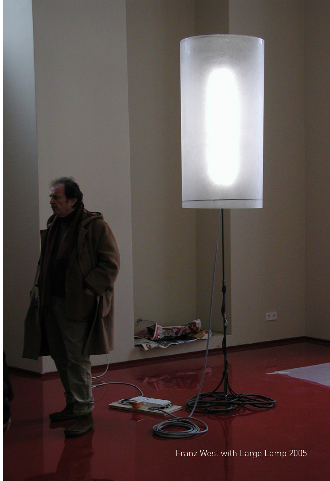
Franz West with Large Lamp 2005