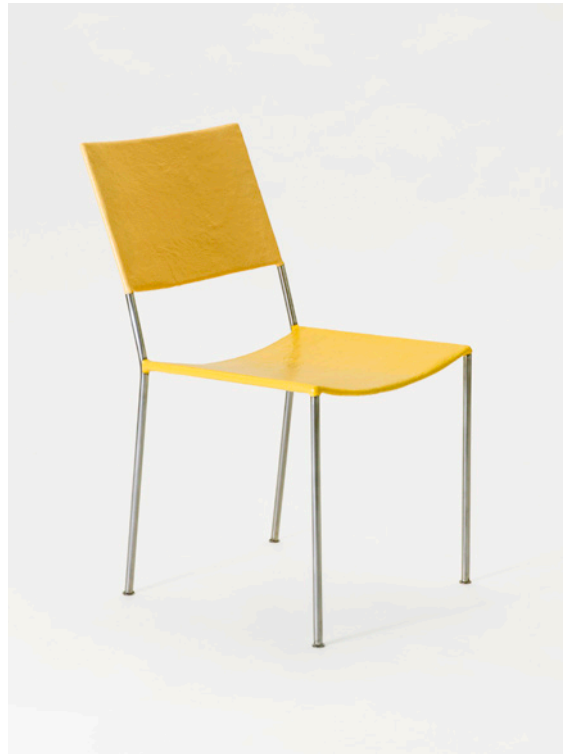
color combination 6