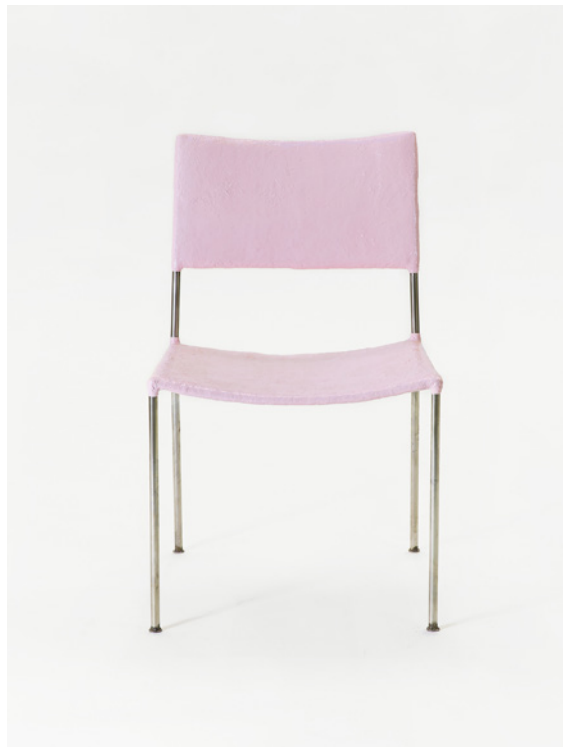
color combination 3