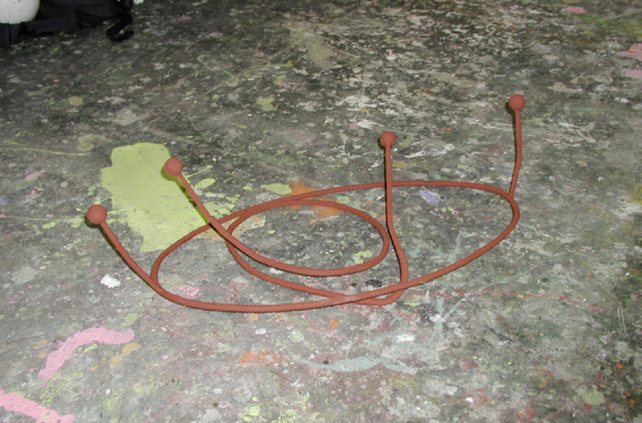
Atelier Esteplatz, 2002, Foto: Atelier Franz West