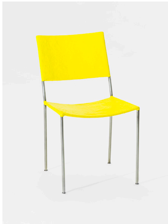
color combination 12