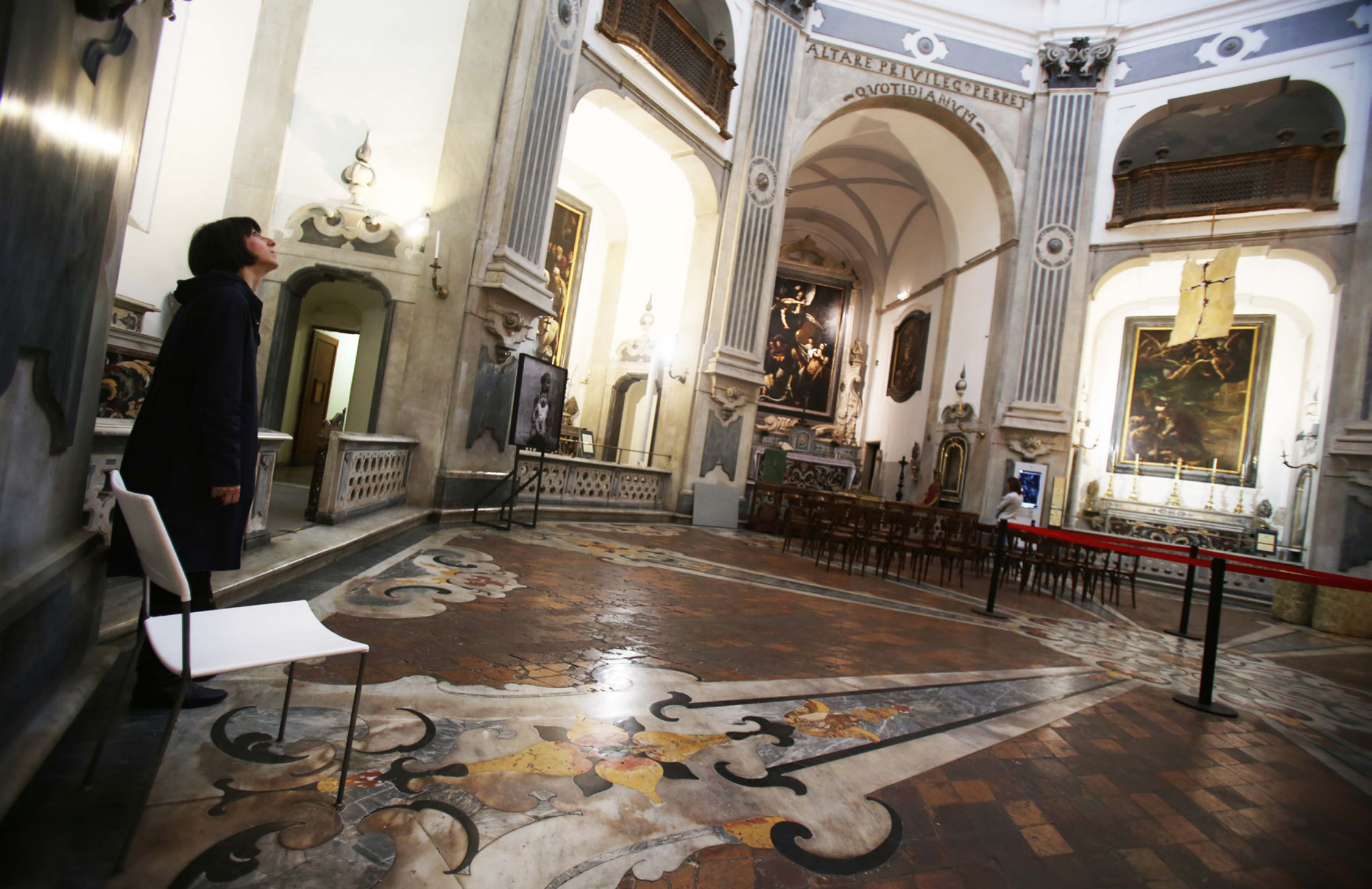
Installation view, Franz West, Sette Opere PER la Misericordia II edizione, Pio Monte della Misericordia, Neapel 2013 (24.5.-24.8.2013)