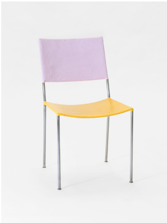
color combination 16