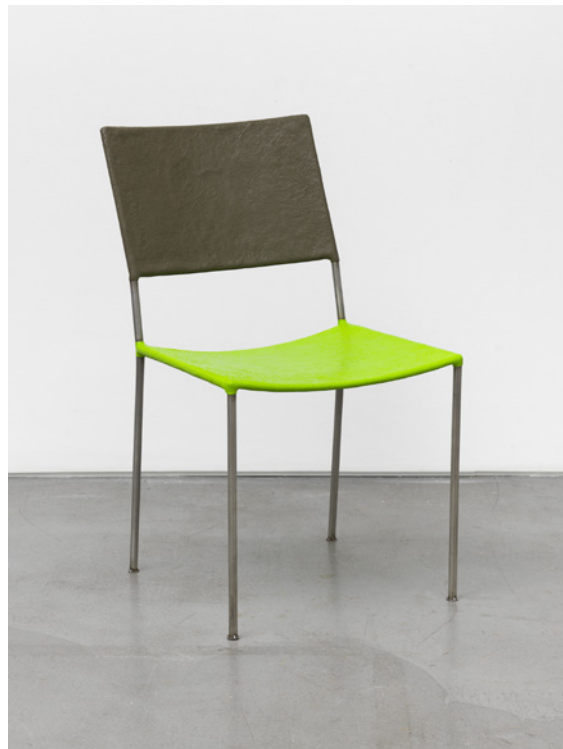
color combination 2