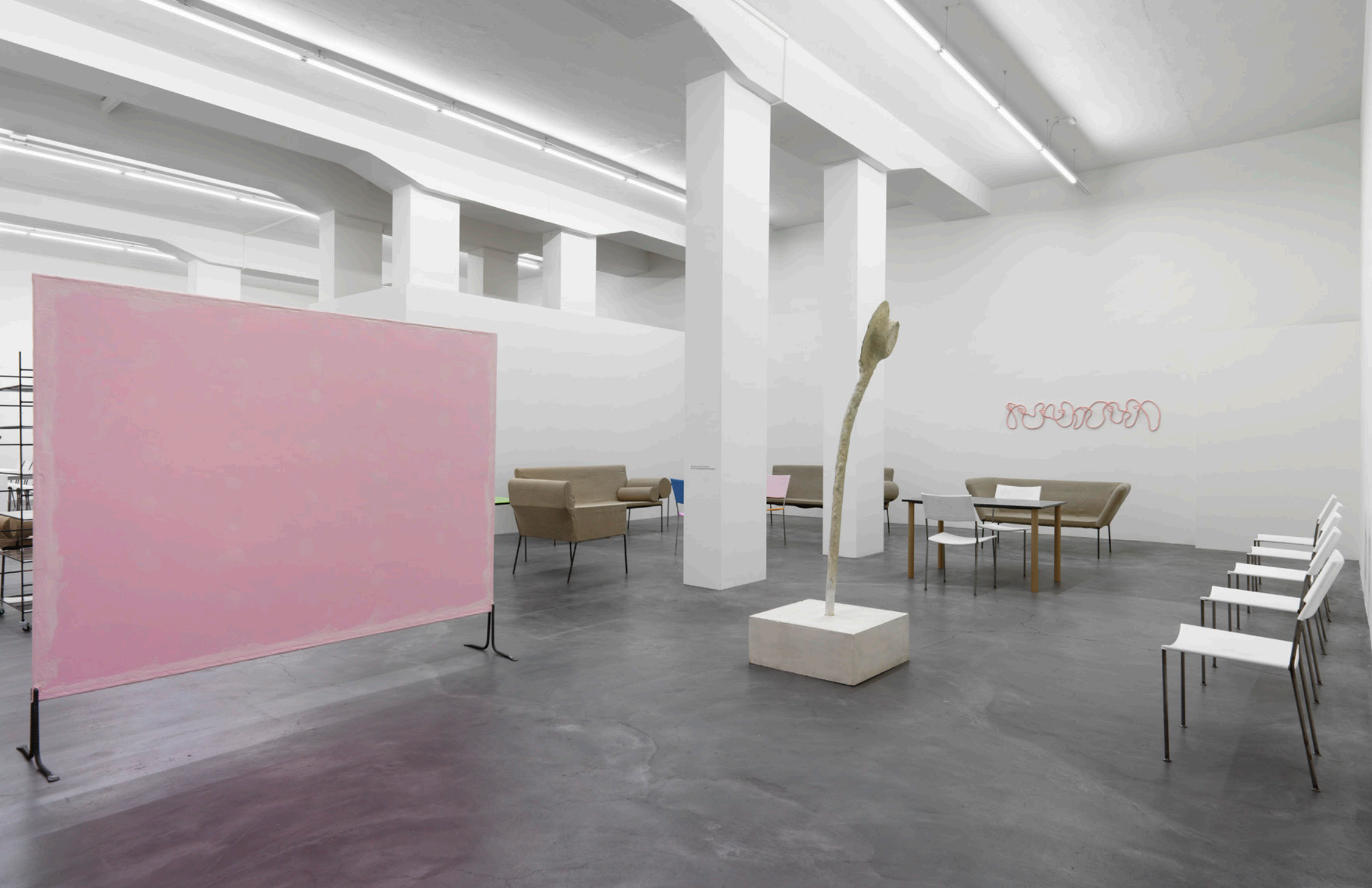
Installation view, Franz West, Möbelskulpturen / Furniture Works, Galerie Eva Presenhuber, Zürich 2015, (29.08 - 7.11 2015)