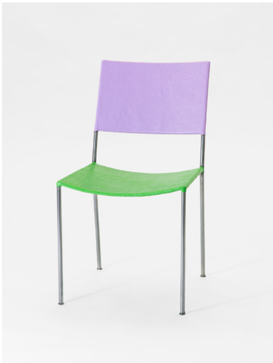
color combination 4