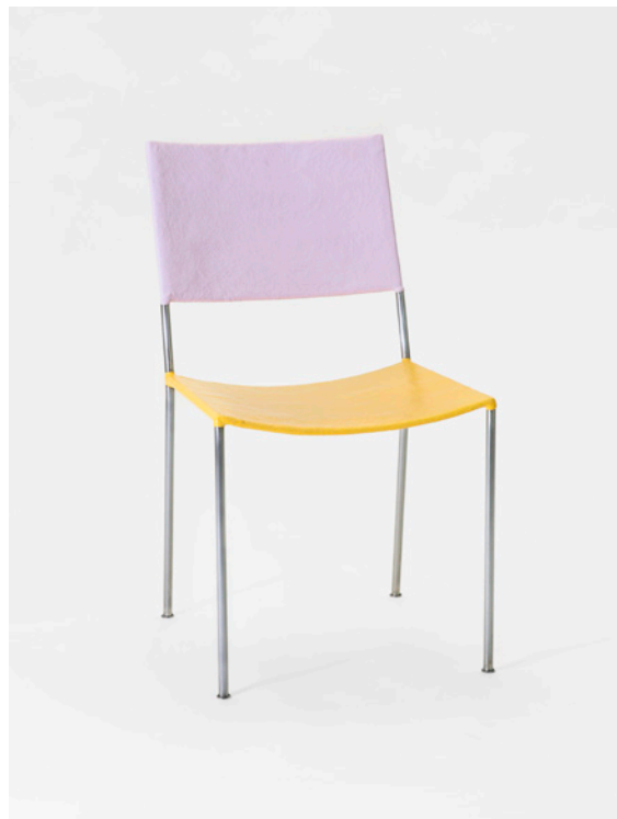
color combination 16