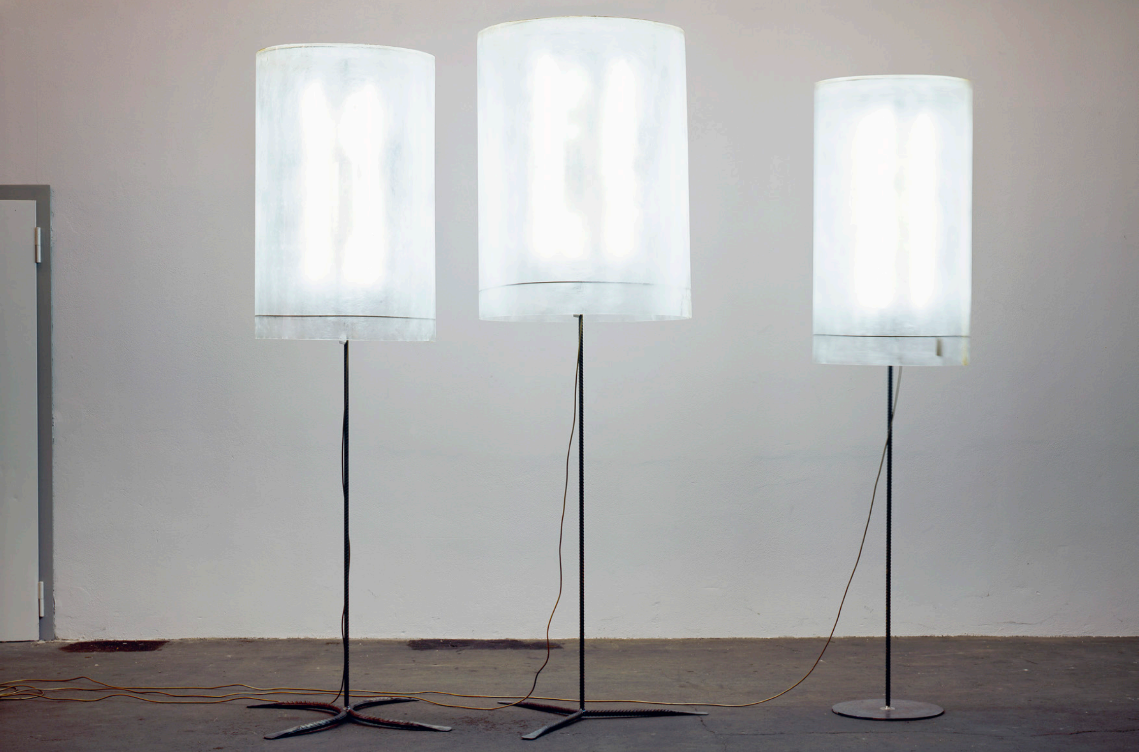
Atelier Esteplatz 2005