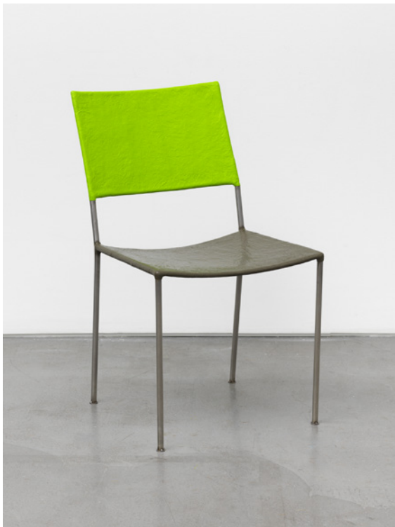
color combination 15