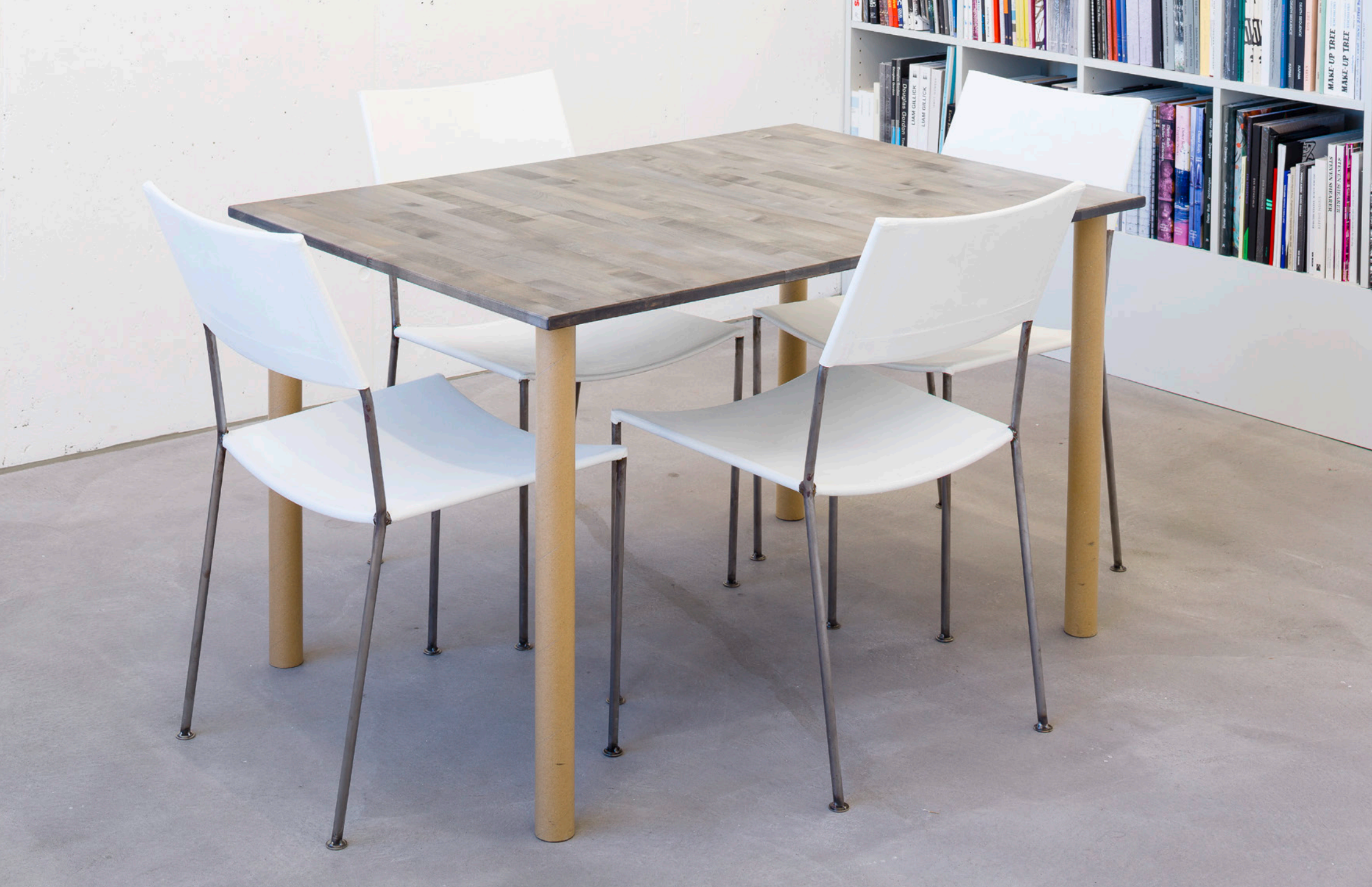
Installation view, Franz West, Möbelskulpturen / Furniture Works, Galerie Eva Presenhuber, Zürich 2015, (29.08 - 7.11 2015)