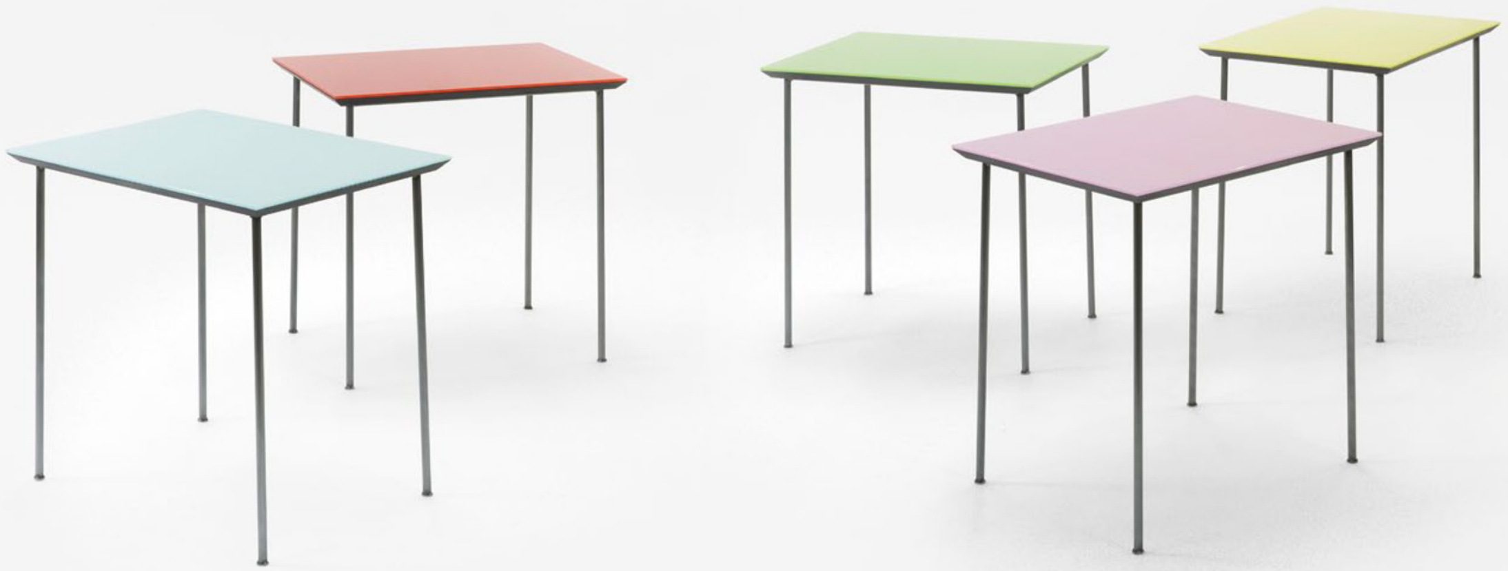
Franz West, Side Table, various colors