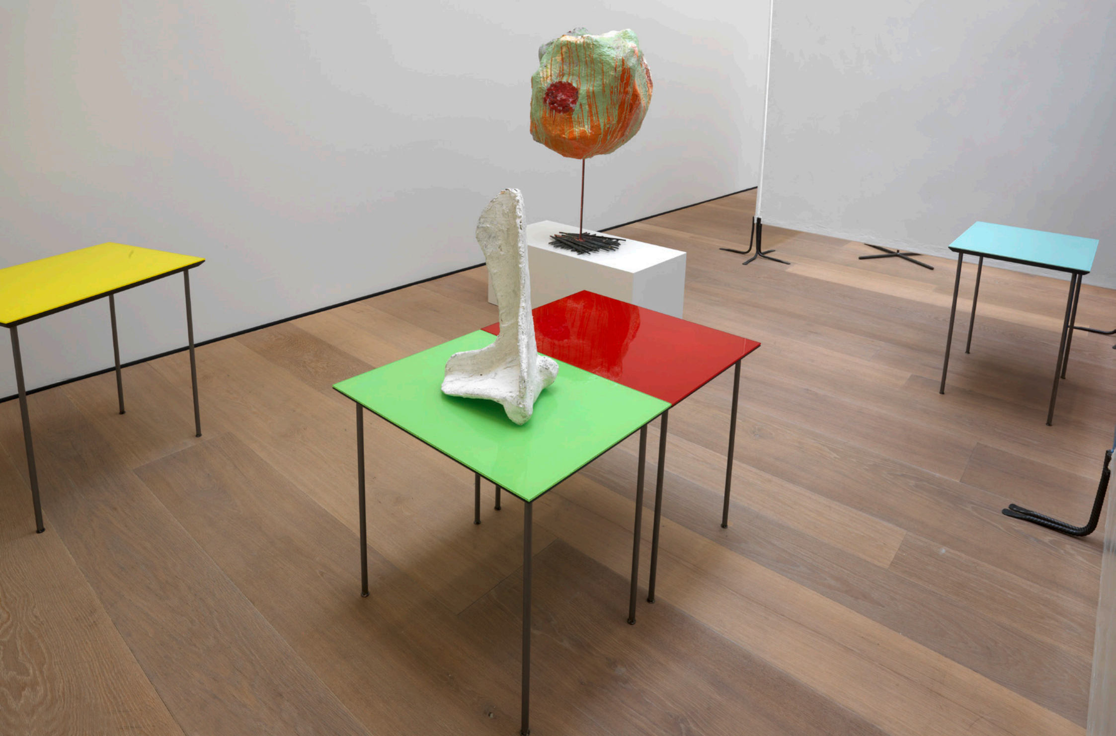
Installation view, Franz West, Vom Nutzen (Das Nützen) , Galerie Bärbel Grässlin, Frankfurt am Main 2010 (29.5.-31.7.2010), Katalog