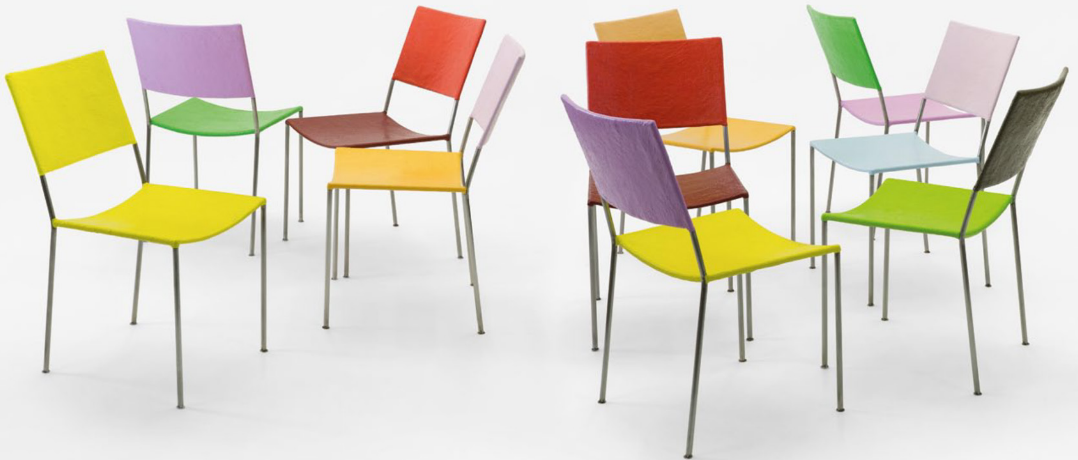
Franz West, Artist's Chair, various colors