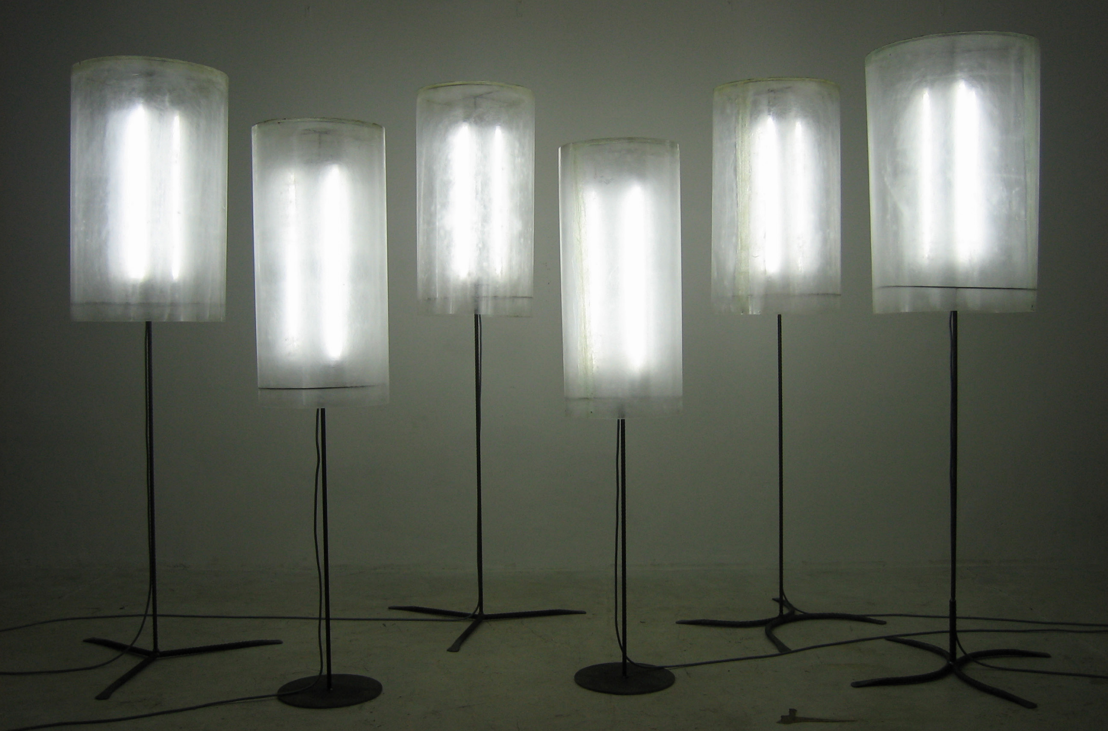
Atelier Esteplatz 2005