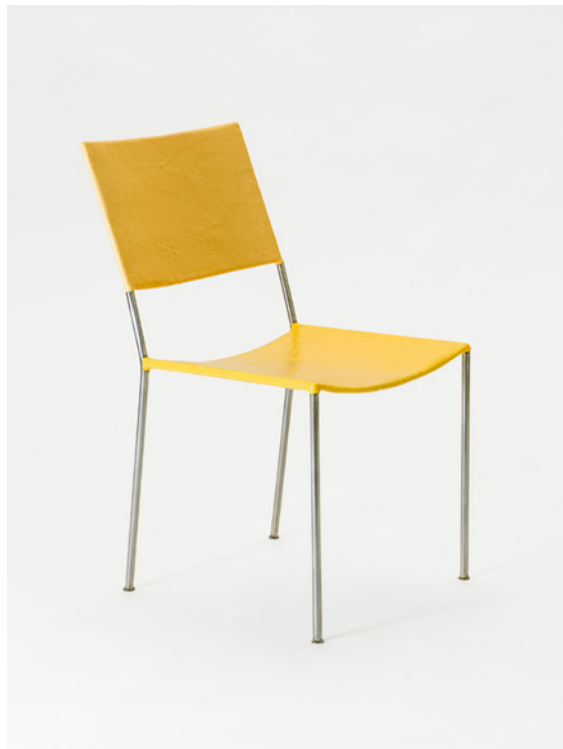
color combination 6