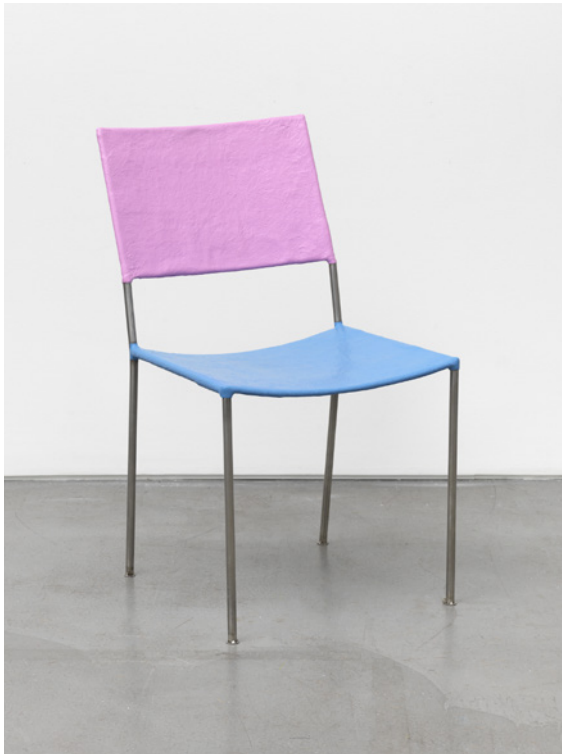
color combination 14