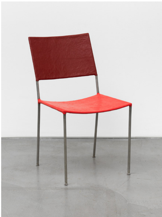
color combination 5