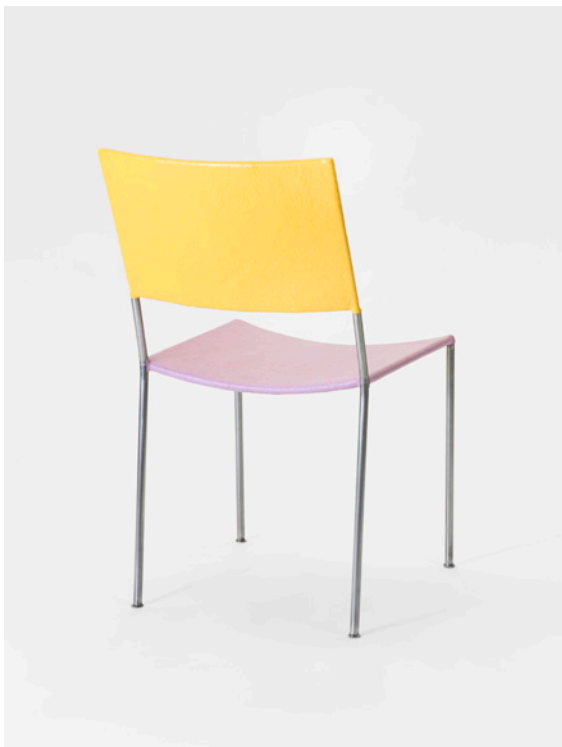
color combination 8