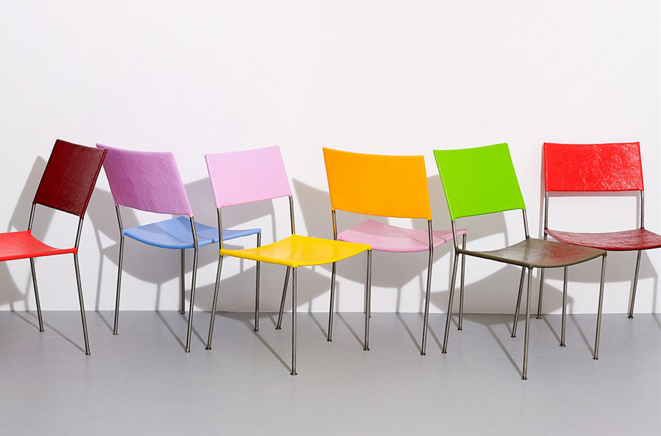
Franz West, Artist's Chair, various colors