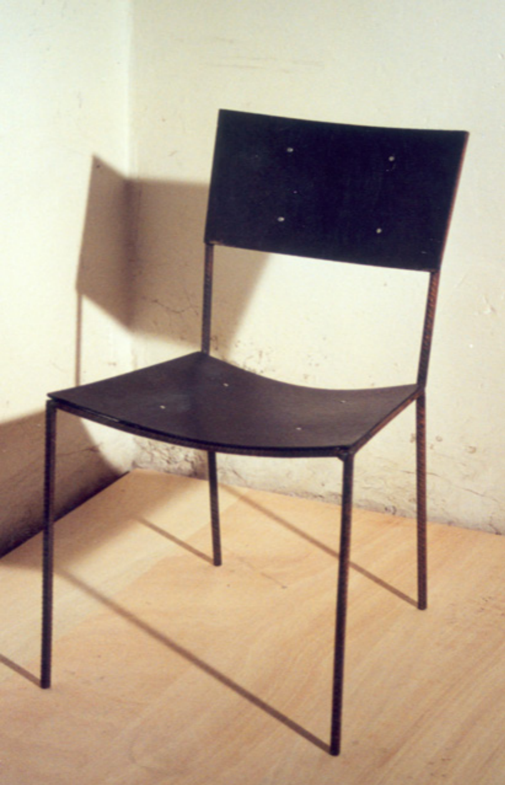
Atelier Esteplatz, 2001