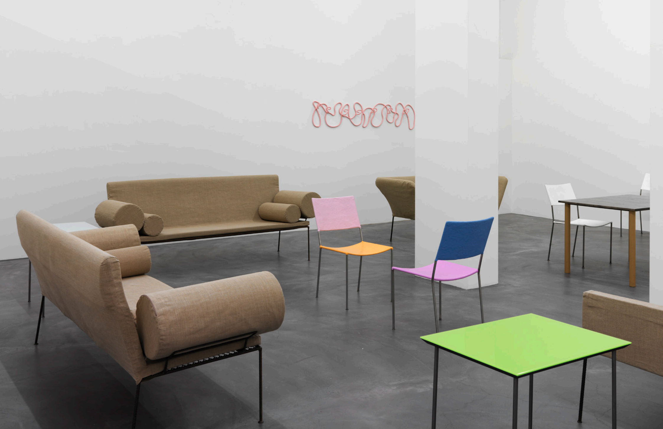
Installation view, Franz West, Möbelskulpturen / Furniture Works, Galerie Eva Presenhuber, Zürich 2015, (29.08 - 7.11 2015)