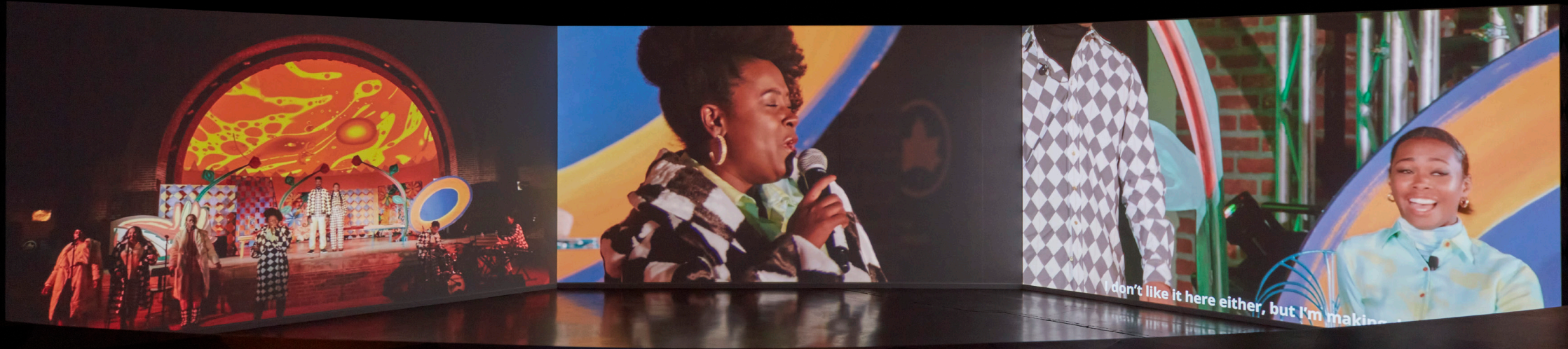
TSCHABALALA SELF SOUNDING BOARD, 2021